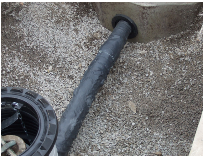
Typical Installation of a FLEX PROTECTOR™ FP-1

FLEX PROTECTORS are highly resistant to petroleum based fuels and offer long-term resistance to corrosive soils. Their unique polymer formulation insures long service life. Unlike cathodic protection, regular inspections by a "CATHODIC PROTECTION TESTER" and the resulting paperwork/documentation are NOT required with FLEX PROTECTOR . Due to their unique ability to "shrink fit" and to conform to various dimensions, there is no need to stock many different sizes of FLEX PROTECTORS .